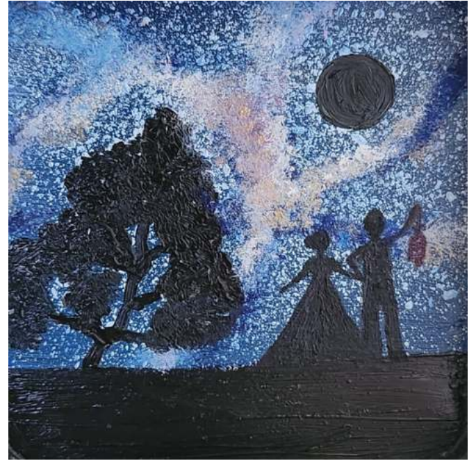
Sahassra , G9