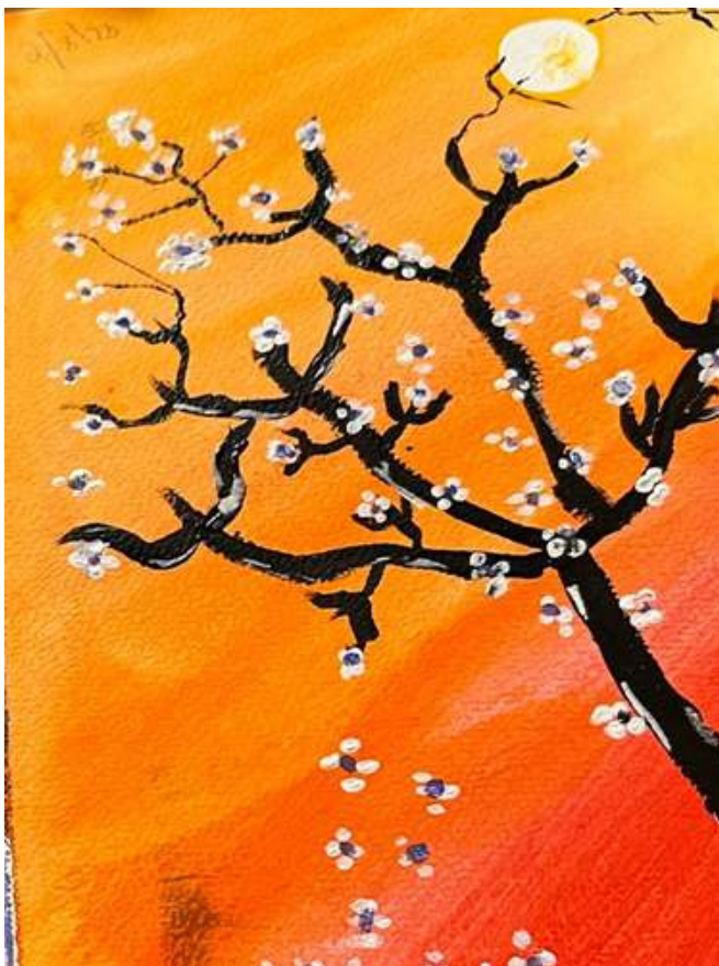
Farhana , G9