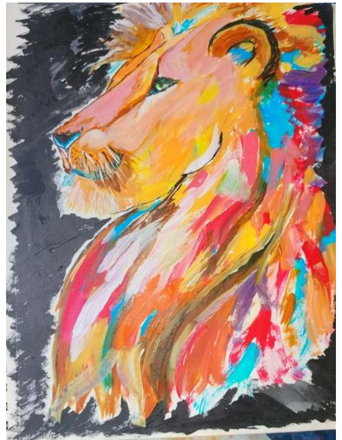
Nehara , G9