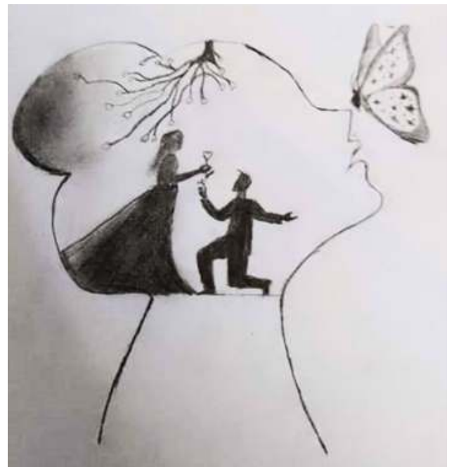
Aviv , G9